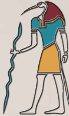
Thoth, a moon deity — god of writing, counting, and wisdom.