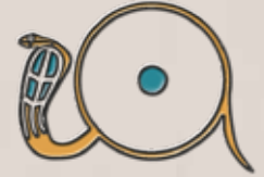
Sun God Ra — his name is thought to mean creative power