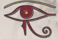
Eye of Horus — amulet against injury and evil