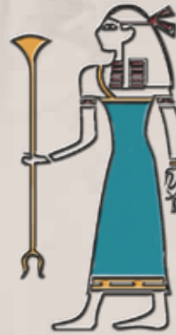
Isis, wife of Osiris, mother of Horus and Mistress of Magic — giver of life and food to the dead