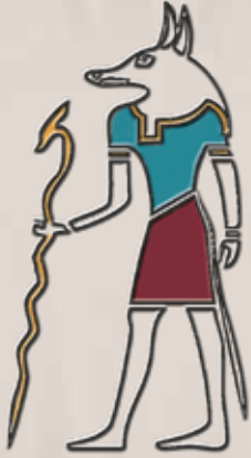
Anubis, a god of mummification — protected the dead from deception and eternal death